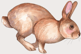
small and fast