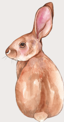
plain brown colour