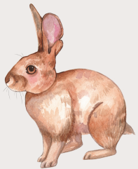
long, lean limbs

The only WILD rabbit on Vancouver Island is the Eastern European Cottontail. These rabbits are lean, agouti (brown), rounded and short little ears. Their faces are much pointer than their domestic counterparts. These were introduced to the island in the 60s.